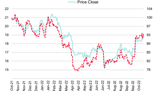
Thai Union Group (TU TB)